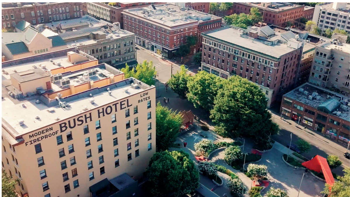
The Chinatown International District