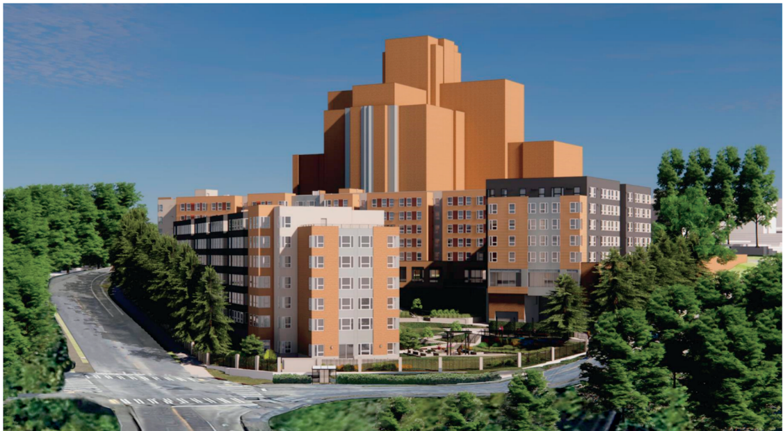
The North Lot